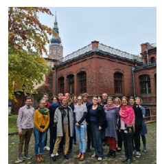
FIGURE 2. Members of the Greifswalder Netzwerk Medical Humanities (10/2023)